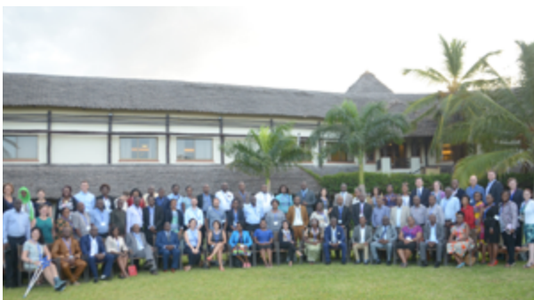
Members of the RBM SBCC WG's 4th Annual Meeting in Dar es Salaam, Tanzania, in 2017.

The RBM SBCC Working Group is mandated with convening those with a common interest in the voluntary and open sharing of knowledge. To that end, the SBCC Working Group encourages active participation by endemic country practitioners.