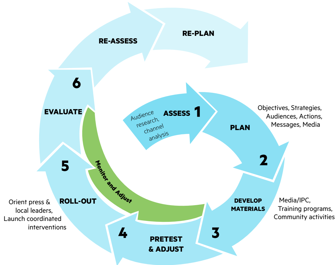
Figure 3: Systematic and Iterative SBCC Planning Process

Audience analysis: Malaria control programmes focus on populations most at risk, including those in specific regional, socioeconomic and biological groups, such as pregnant women. Accordingly, socio-demographic and psychographic characteristics of target audiences and those who influence them should inform